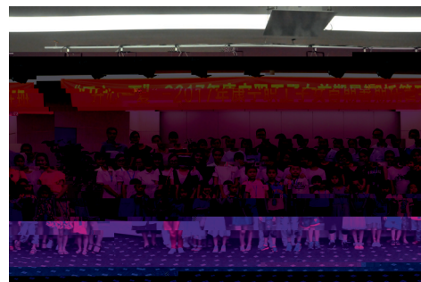
Summer Holiday Child Care Center for Employees' Children