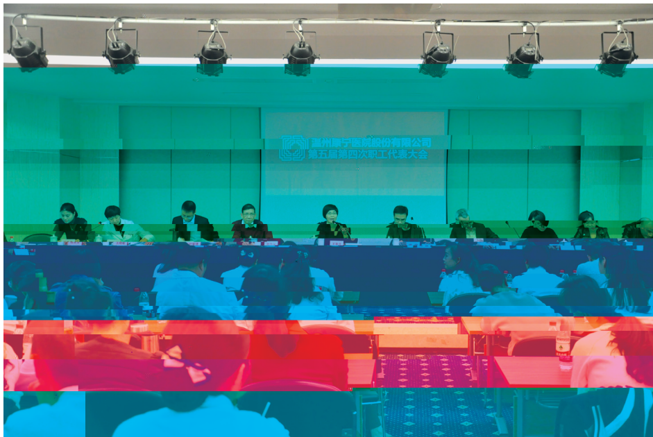
2017 Meeting of employee representatives

Attaching great importance to relations with employees, the Group has proactively maintained effective communication with employees at various levels, established a mutual-trust working environment and maintained good labor relations. We deliberate, discuss and confirm the excellent figures of the year with employees on an annual basis at the meetings of employee representatives established in 2012. The 2017 meeting of employee representatives was held in March 2017, adopting the Work Report of Wenzhou Kangning Hospital and Work Report of Receipts and Expenses of Labor Union Expenditures of Wenzhou Kangning Hospital Co., Ltd. in 2016 by voting. Moreover, we also have constant communication channels for employees to freely express their opinions, and convey feelings of the common people to the higher authorities. Employees may voice their opinions on the Company to HR Department over the phone or in person, which can enhance the communication between employees at various levels.