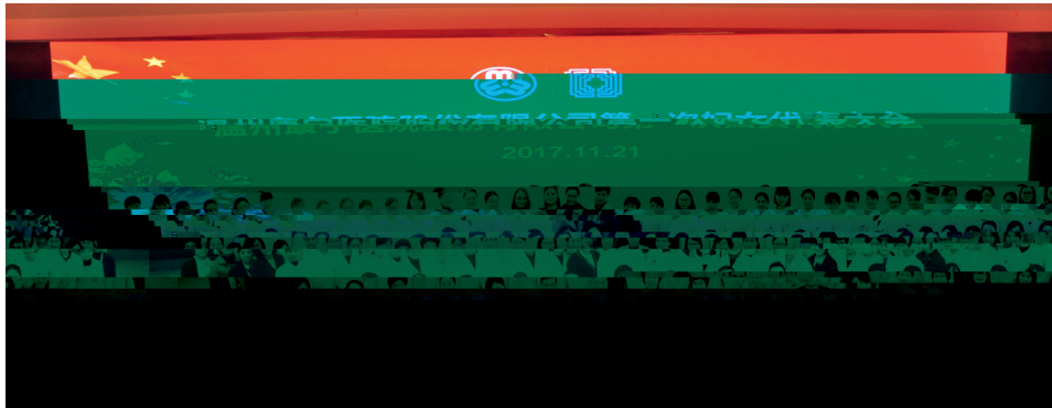
Establishment of Women's Federation

The Group highly emphasizes and supports the career development of female employees. Female employees account for more than half of the total employees, and most of them work at the frontline posts, so they are the major force promoting the development of the Group. Therefore, we formally established the women's federation in November 2017 and solemnly held the first female meeting of employee representatives. The federation provides a platform for female employees to enhance their qualities and provide mutual assistance for others. We believe that the women's federation can give better play to the active role of female employees in participating in decision-making, protecting rights, enhancing efficiency and promoting development.