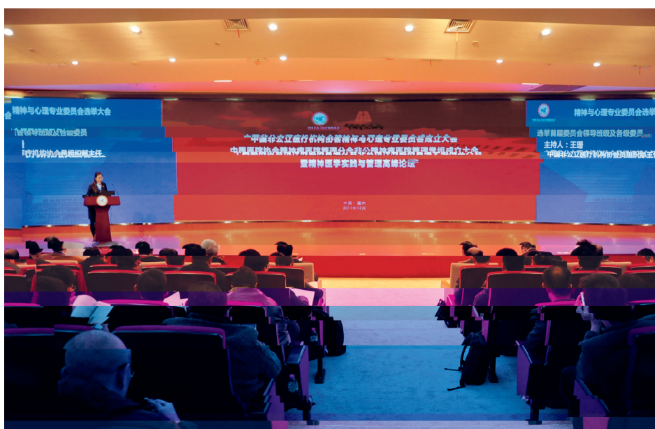
Founding Conference of the Specialized Psychiatric and Mental Committee of Chinese Non-government Medical Institutions Association (CNMIA) & Psychiatric Practice and Management Summit Forum

In December 2017, we organized the Founding Conference of the Specialized Psychiatric and Mental Committee of Chinese Non-government Medical Institutions Association (CNMIA) & Psychiatric Practice and Management Summit Forum hosted by CNMIA, during which nearly 200 psychiatric and mental health experts nationwide had a further understanding of the development and prospects of the psychiatric and mental health, which initiated new thoughts on the future development of medical treatment.