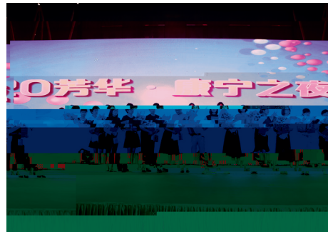
Celebration of the 20th Anniversary