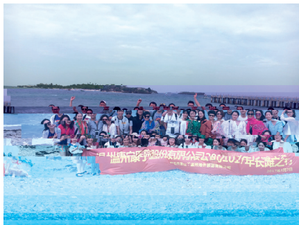
Outstanding Employees Travelling in Boracay Island